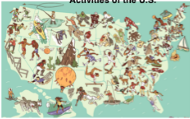
Activities of the U.S.