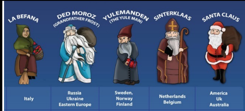
There are several traditions of Santa Claus around the world. Each carry their own cultural style