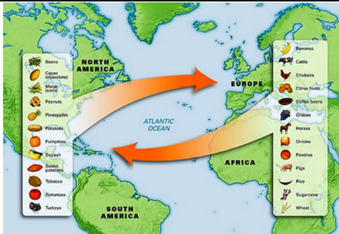
The Columbian Exchange began in early 16 th century when colonists from Europe began transporting food across the Atlantic